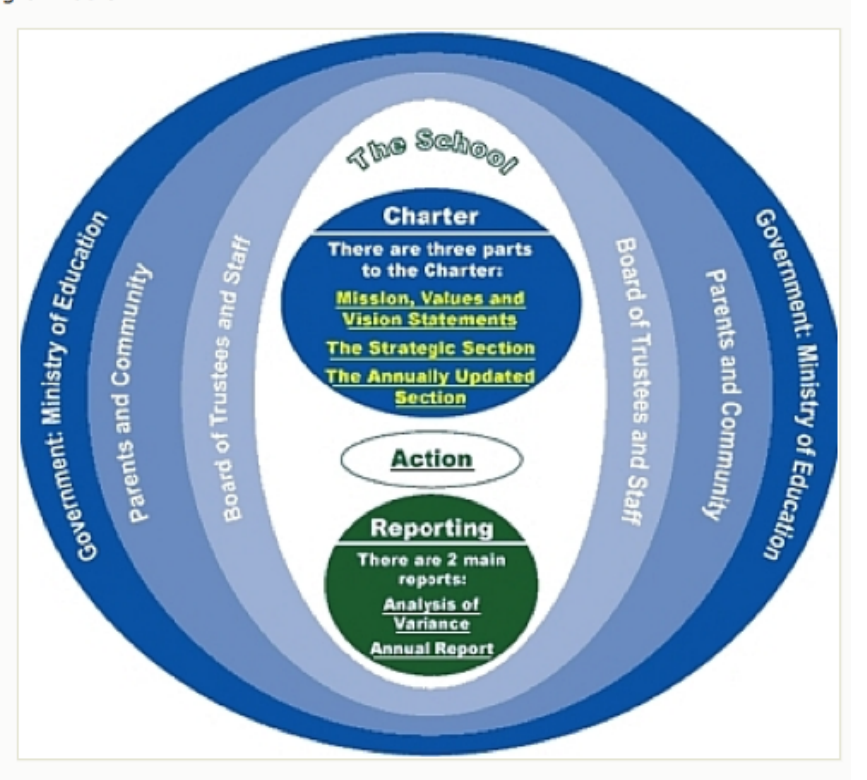
Diagram 1: Relationship of charter, plans, and reports

The relationship between the planning and reporting process is represented in the diagram below.